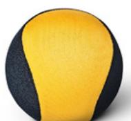
Water Skimming Bounce Ball

Exciting Term 4 Polar Savers rewards are still available! You can order rewards from any term after they are released all through the year until stock runs out.