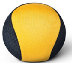
Water Skimming Bounce Ball

Exciting Term 4 Polar Savers rewards are still available! You can order rewards from any term after they are released all through the year until stock runs out.