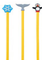
Polar Pencils & Pencil Toppers

School Banking is also a great fundraiser for our P&C. The P&C receives a Regular Savers Contribution of $5 for every 10 deposits processed per student along with an annual contribution based on the number of students who made at least one School Banking deposit in the prior year.