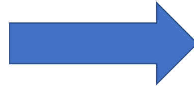
Proposed Winter Uniform colours

...but boys and girls could be wearing the same colour