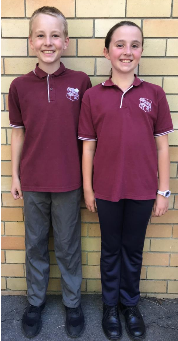
Current Winter Uniform colours