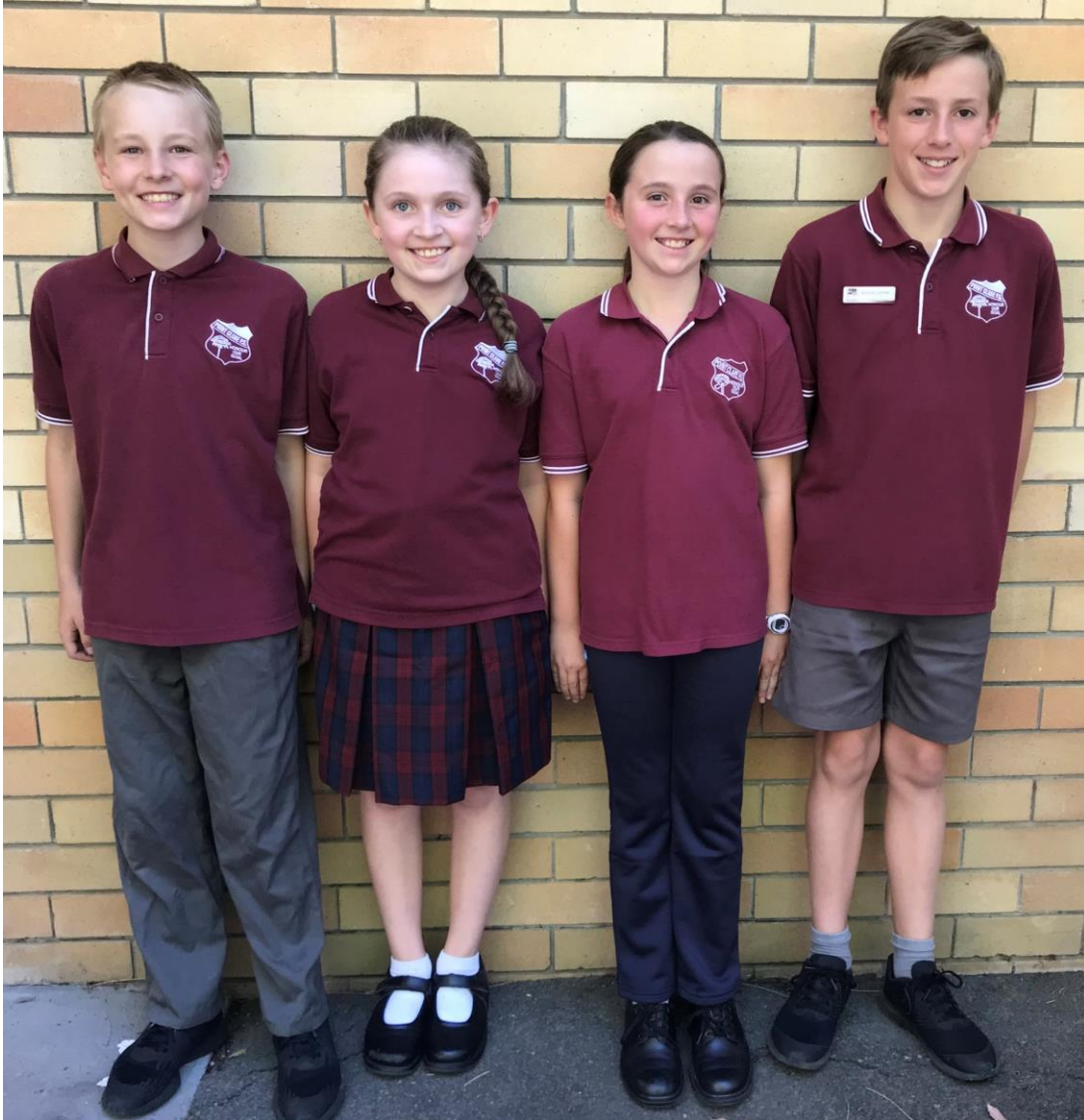
Current Winter Uniform