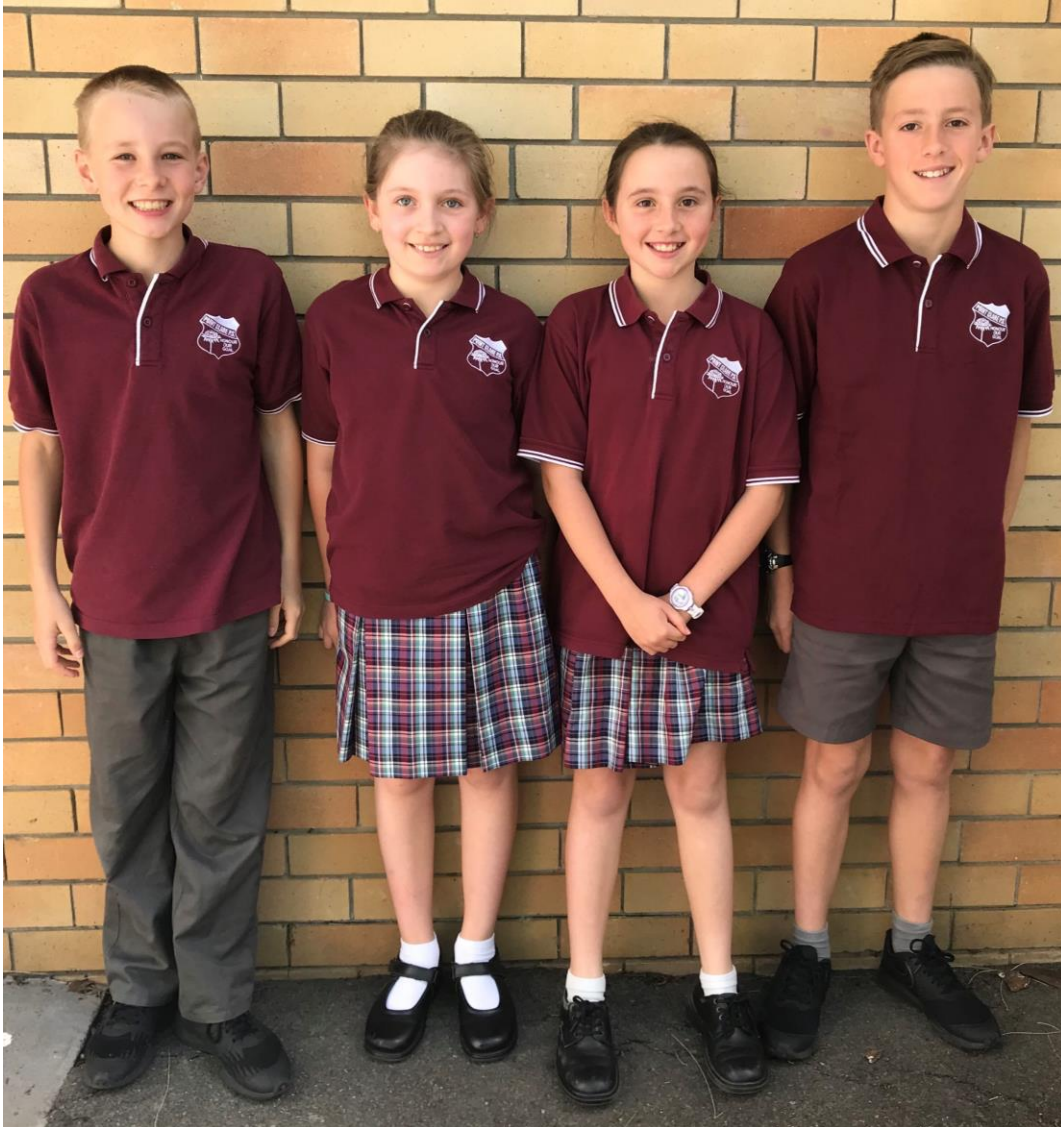
Current Summer Uniform