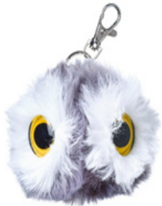
Arctic Owl Fluffy Keyring

Exciting new Term 3 Polar Savers rewards are now available, while stocks last!