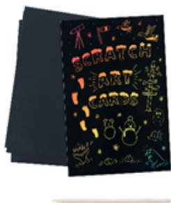
Scratch Art Cards

For every deposit made at school students will receive a silver Dollarmites token. Once students have individually collected 10 tokens they can redeem them for exclusive School Banking reward items in recognition of their regular savings habits. There are two new items released each term so be sure to keep an eye out for them!