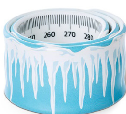
Icicle Slapband Ruler

For every deposit made at school students will receive a silver Dollarmites token. Once students have individually collected 10 tokens, they can redeem them for exclusive School Banking reward items in recognition of their regular savings habits. There are two new items released each term so be sure to keep an eye out for them!