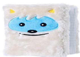
Yeti Fluffy Notebook

Exciting new Term 2 Polar Savers rewards are now available, while stocks last!